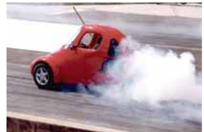
"The company was founded at the track"

For more information please go to http://www.alltraxinc.com